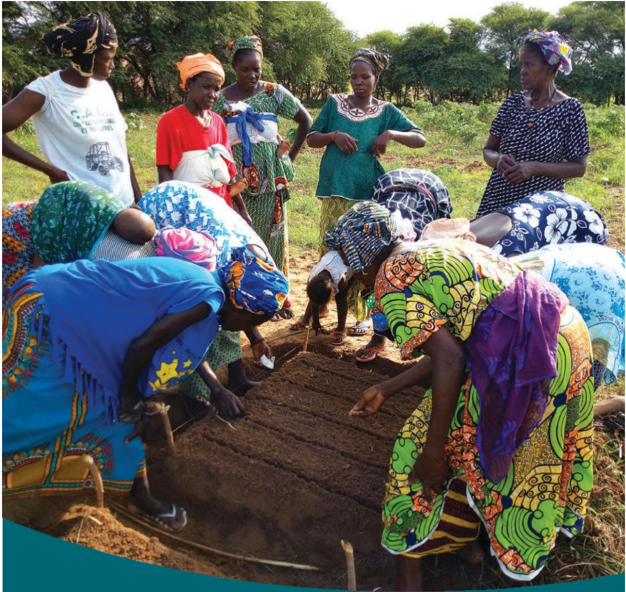
AgriFed project in the field of climate resilient agriculture in Mali, implemented by UN Women and co-financed by Luxembourg, September 2018.