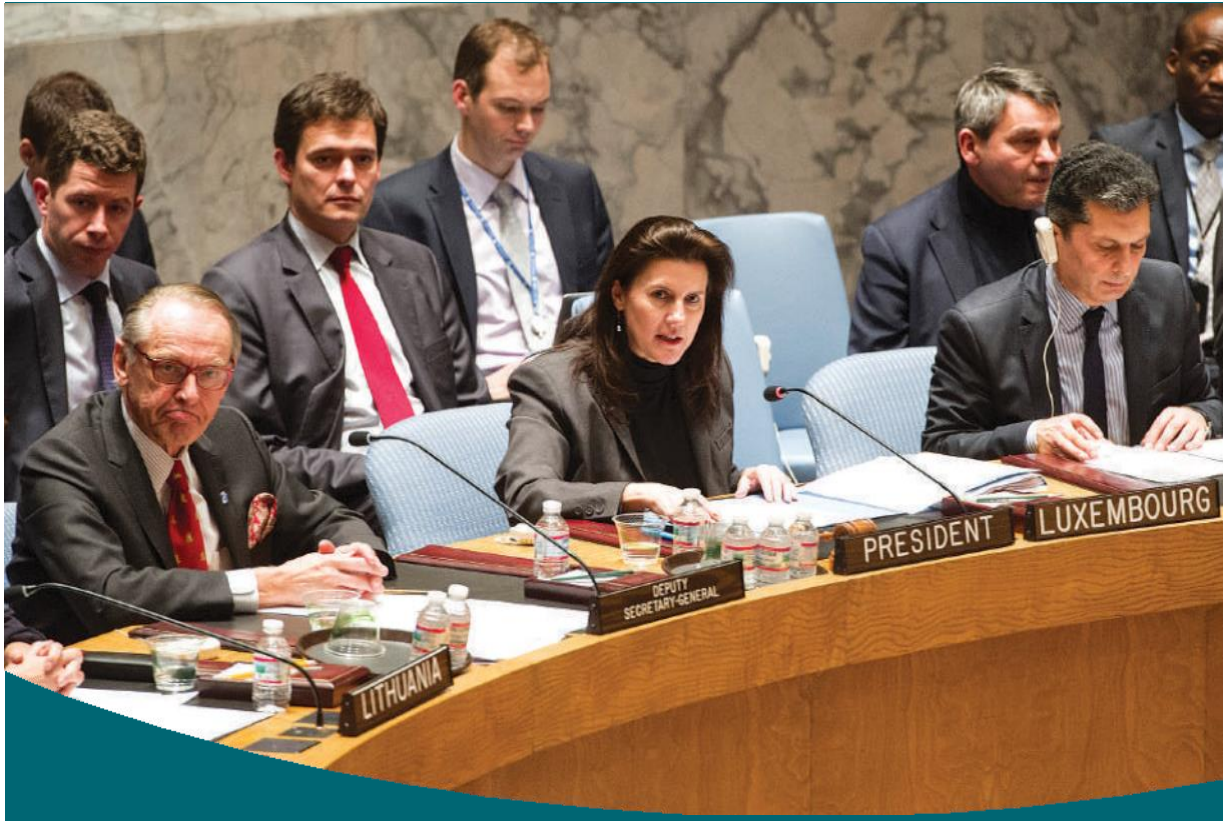
Luxembourg presidency of the Security Council, March 2014