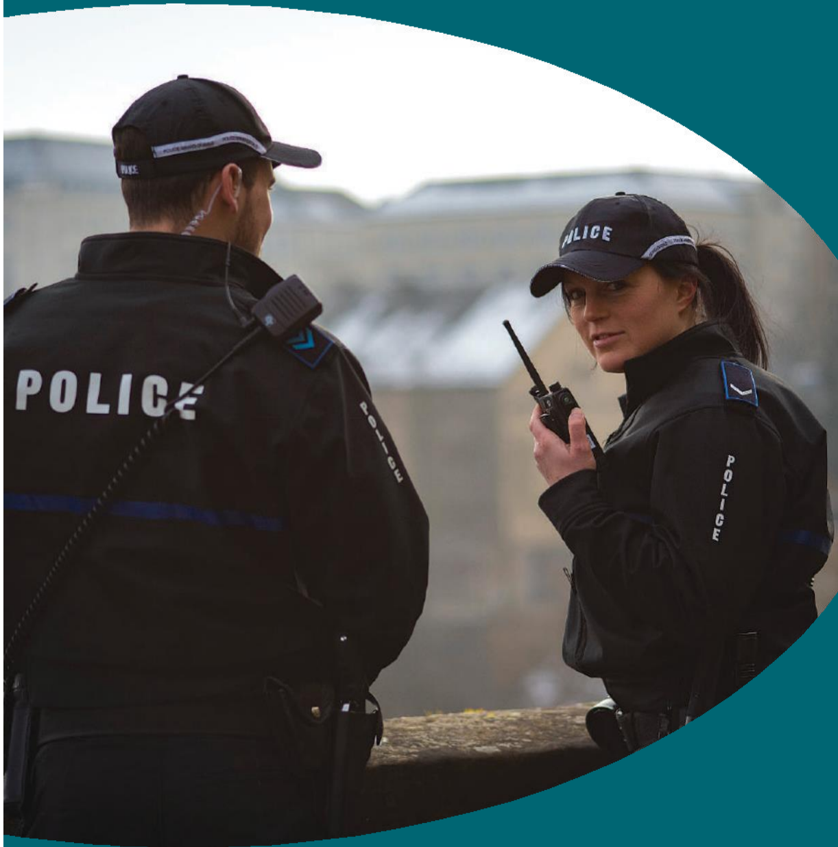
Grand-Ducal police patrol in the city of Luxembourg