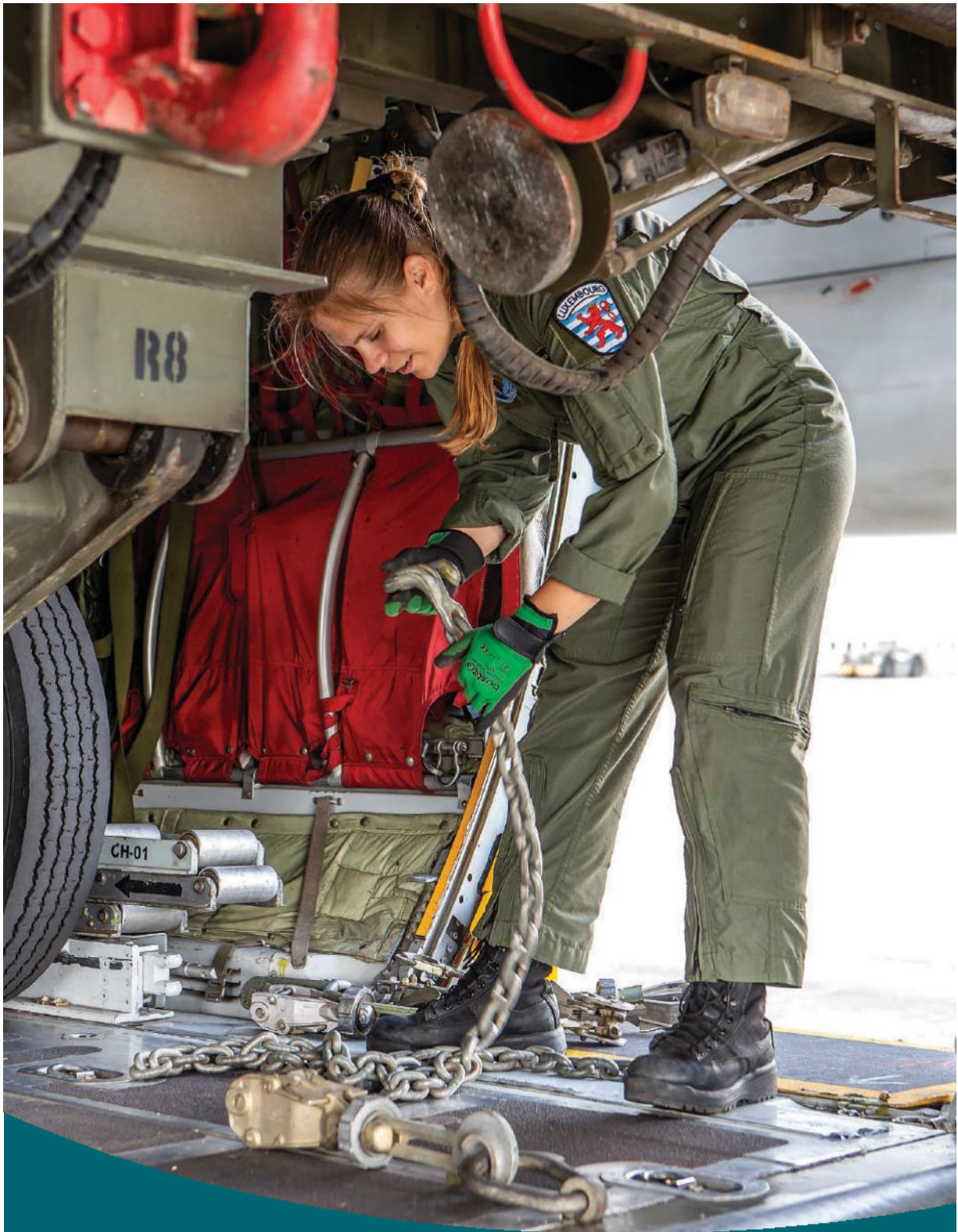
A Luxembourg Army loadmaster takes part in a loading exercise, Melsbroek Air base (Belgium)