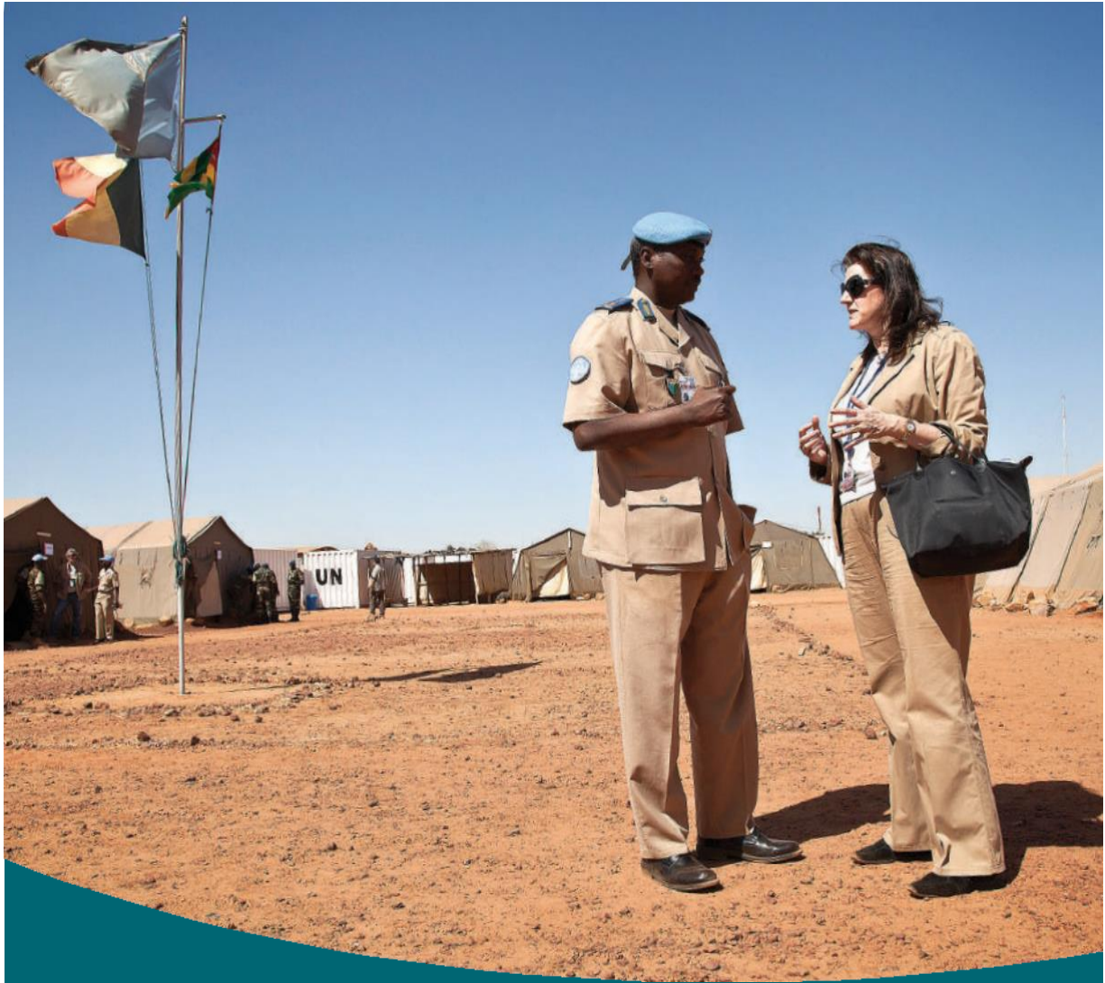
H. E. Sylvie Lucas, permanent representative of Luxembourg to the United Nations during a visit of the UN Security Council to Mali, February 2014